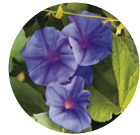
Ipomée d'Inde Ipomea Learii