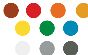
CUSTOMIZABLE COLOR Other colors available upon request