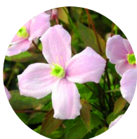
Clématite des Montagnes 'Mayleen' Clematis montana 'Mayleen'

For the Olympe edition : 4 climbing plants