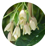
Vigne bleue de Chine Holboellia coriacea