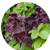
Akébie Akebia quinata