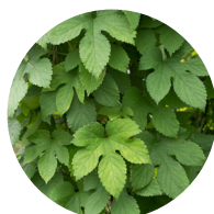
Houblon Humulus Lupulus