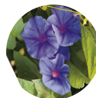
Ipomée d'inde Ipomea Learii