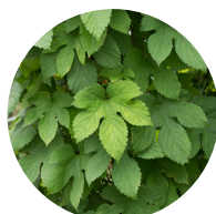
Houblon Humulus Lupulus