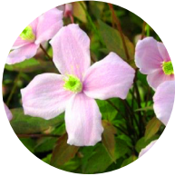
Clématite des Montagnes 'Mayleen' Clematis montana 'Mayleen'

For the Olympe edition : 4 climbing plants