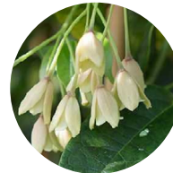
Vigne bleue de Chine Holboellia coriacea