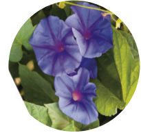
Ipomée d'inde Ipomea Learii