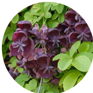
Akébie Akebia quinata